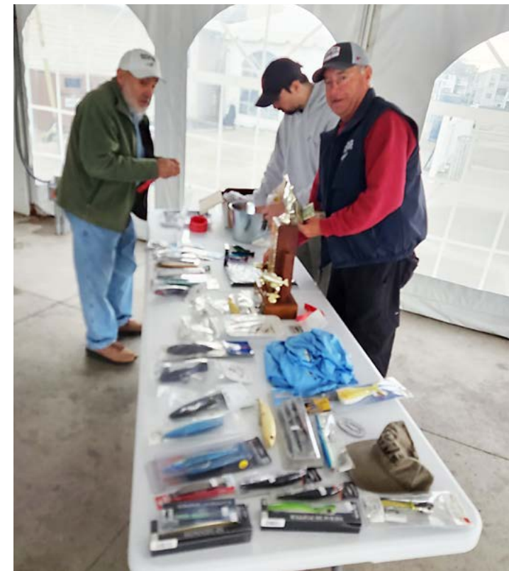
There were many generous donations of raffle prizes by the participating clubs. R.I.M.S. donated $223 from their annual Saturday morning breakfast!!!

Thanks to the generosity of the 8 participating clubs and their members, we donated the proceeds of $1500 to the Three Angels Fund!!!! From their website: