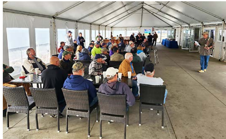
The traditional Fisherman's Breakfast was held at the Andrea. Some 56 people enjoyed camaraderie and many fish stories were told.