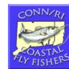
CT/RI Coastal Fly Fishers