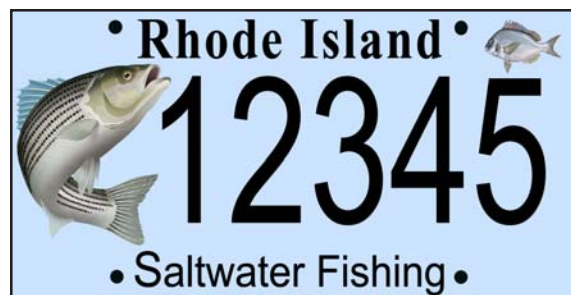
Conceptual plate design

It now is pending the Governor Raimondo's signature. If she signs the legislation, but plate process will begin.