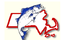
Massachusetts Striped Bass Assoc.