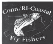
CT/RI Coastal Fly Fishers