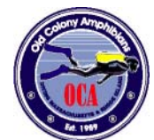
Old Colony Amphibians