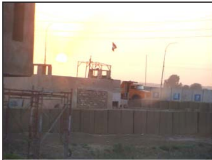
This is an Iraqi checkpoint at about 8:30 pm - temperature 106 degrees!

There's not much to report on from our situation that is new. We are still running operations daily in coordination with Iraqi forces to help achieve security and peace among our AO (Area of Operations). There has been a little spike in violence around Iraq, as I see it a futile attempt to disrupt all that has been achieved in the last 6 years or so.