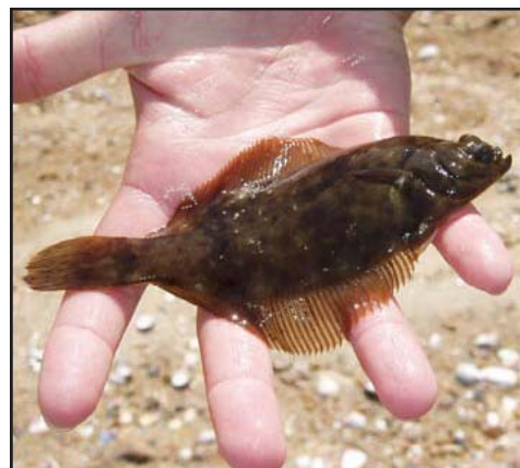
Juvenile winter flounder

Since RI has had a complete closure of Narragansett Bay for several